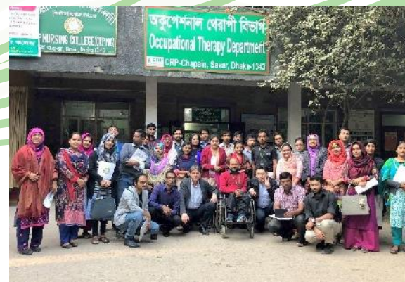
Picture with Clinical and academic Occupational Therapists

To conclude, it was a fruitful cultural exchange that helped our team to learn more about the rehabilitation process in low income countries. Before returning to Japan, the professors donated a few books to the department of occupational therapy, BHPI, and expressed their appreciation for the warm hospitality that they received from everyone at CRP.