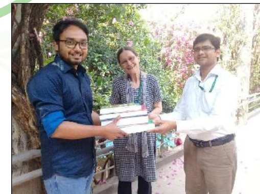
Books from Japan handed over to the head of occupational therapy department, BHPI