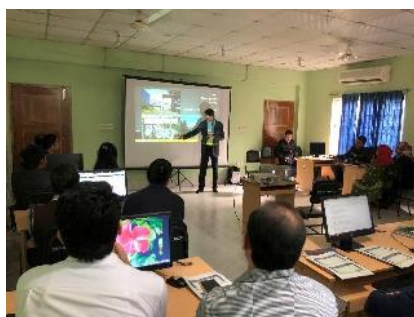
Workshop with post-graduate international students

On 4th February, the professors visited the Old People's Rehabilitation centre, Gazipur to understand the situation of elderly people living in care homes, and to sound out the possibility of conducting research activities related to occupational therapy in elderly people's lives.