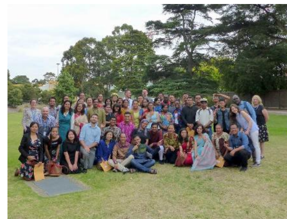
Australian Awards' Scholars in Monash 2018