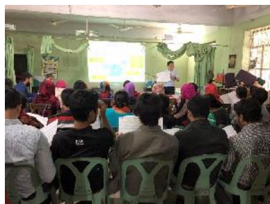
Workshop with Clinical Occupational Therapists

On 4th February, the professors visited the Old People's Rehabilitation centre, Gazipur to understand the situation of elderly people living in care homes, and to sound out the possibility of conducting research activities related to occupational therapy in elderly people's lives.