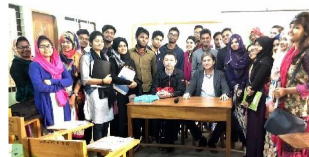
A snapshot with undergraduate final year students