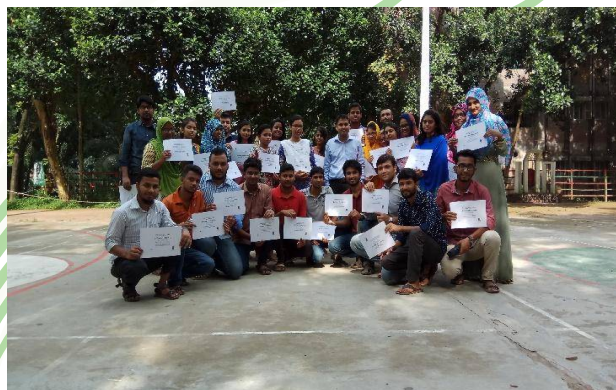
Physiotherapy Students (Session: 2012-2013)