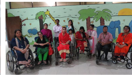
Audience, guests and participants enjoying the puppet show at CRP's paediatric unit