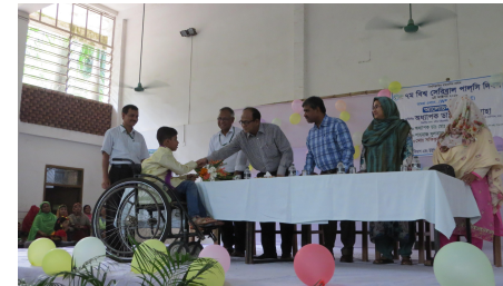
Programmes on 7th World Cerebral Palsy Day (a rally and discussion)