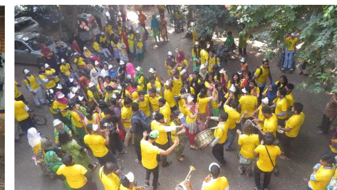
CRP's Occupational therapists enjoying the World Occupational Therapy Day celebration