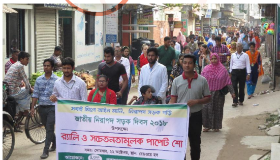
Rally, human chain and awareness raising puppet show on road safety issues on National Road Safety Day observation at CRP