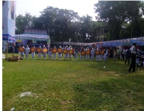
Inauguration of the fair at Savar Upazila ground

The Government of Bangladesh organized the 4th countrywide, National Development Fair from 4- 6 October 2018. CRP participated in this fair organized by Savar Upazila for promoting CRP's services to visitors. In the fair CRP's stall was adorned with handicrafts made by women with disabilities, wooden toys and puzzles, various publications and mental health project activities. The special needs children from William and Marie Taylor School (WMTS) also took part in an inclusive cultural programme and amazed the crowds with their mesmerizing performance at Savar Upazilla playground. The visitors really appreciated and enjoyed watching CRP's activities.