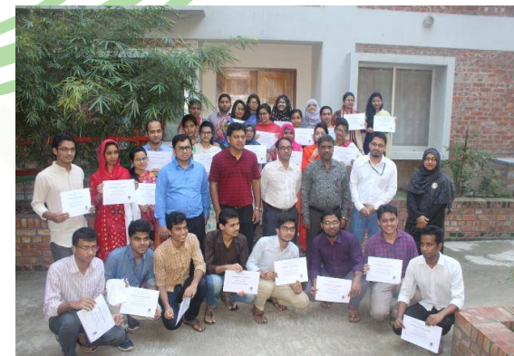
Physiotherapy Students (Session: 2013-2014)