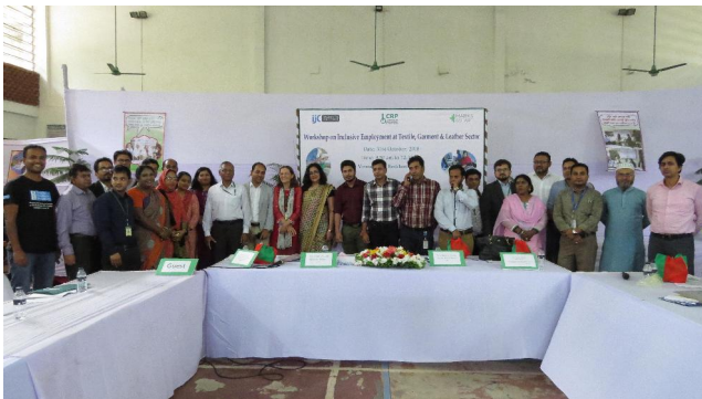
Attendees in the workshop