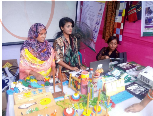
CRP's mental health project staff displaying different items in CRP's stall