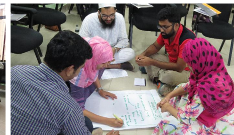
Trainees working in groups