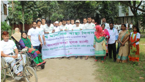
A rally with mental health patients and officials at CRP-Ganakbari on the occasion of World Mental Health day