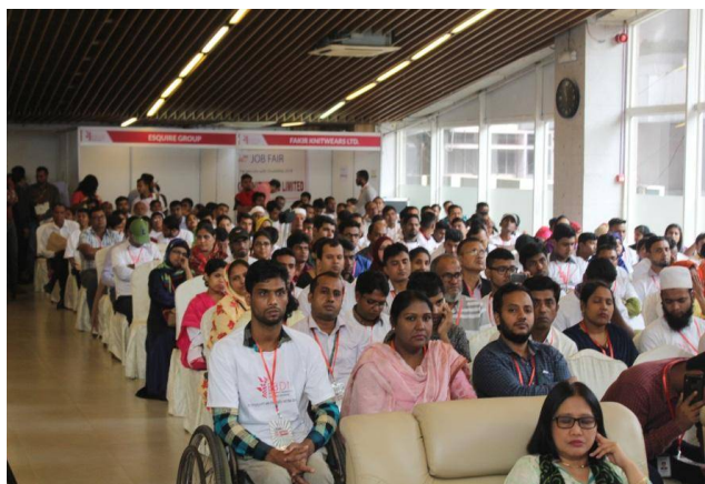
Attendees in the job fair